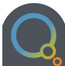
Exhibit and Admission are made possible with generous support from: