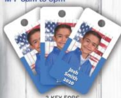
3 KEY FOBs